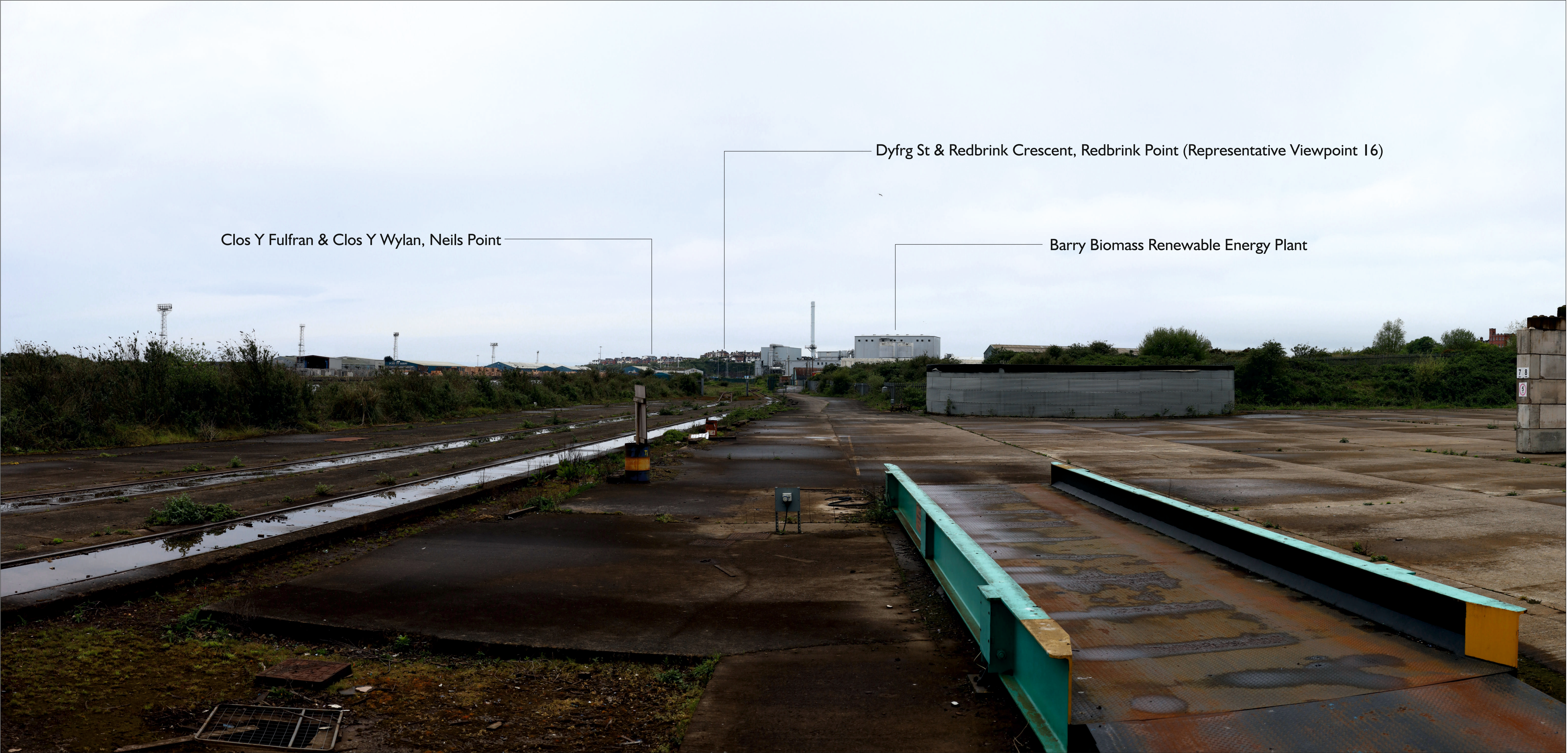
Illustrative Viewpoint I - Looking southwest from southwest end of the Site